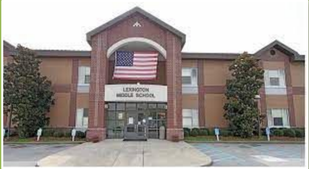
Lexington County School District One